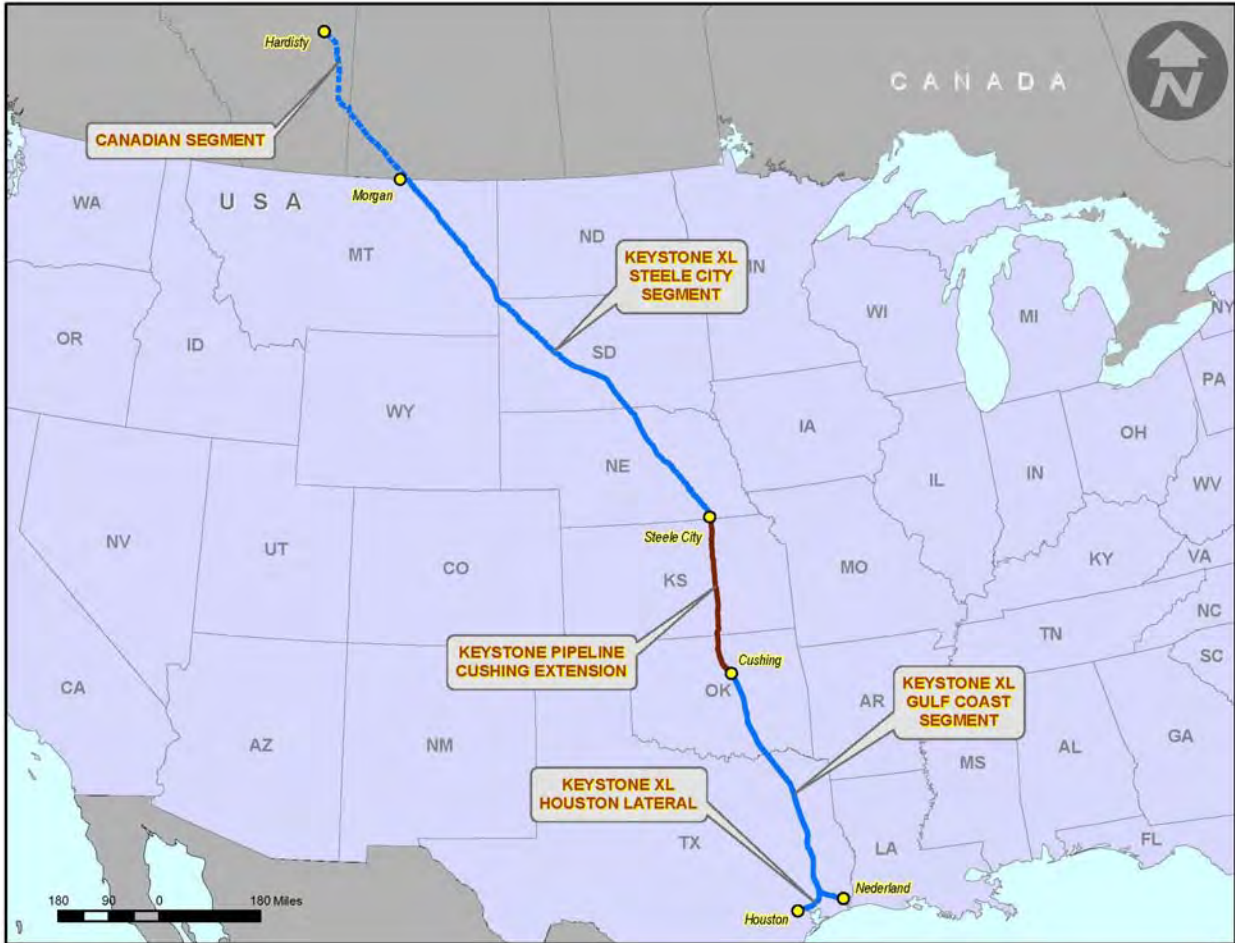
Figure A-1 Overview of the Project

TransCanada Keystone Pipeline, LP (Keystone) proposes to construct and operate a new crude oil pipeline and related facilities from Hardisty, Alberta, Canada to the Port Arthur and east Houston areas of Texas in the United States (US). The project, known as the Keystone XL Pipeline Project (Project), will have a nominal capacity to deliver up to 900,000 barrels per day of crude oil from an oil supply hub near Hardisty, Alberta to existing terminals in Nederland near Port Arthur, Texas, and the Moore Junction in Houston, Texas. See the proposed Project route in Figure A-1 .